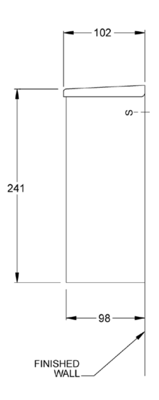
JD MacDonald reserves the right to, and does from time to time, make changes and improvements in design and dimensions. The photographs and line drawings of the products in this flyer are representational only. All dimensions are in millimetres.