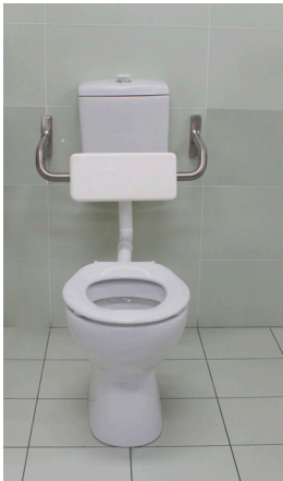
White single flap with back rest