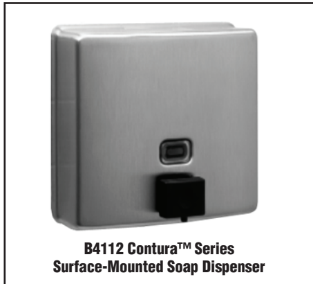
B4112 Contura™ Series Surface-Mounted Soap Dispenser