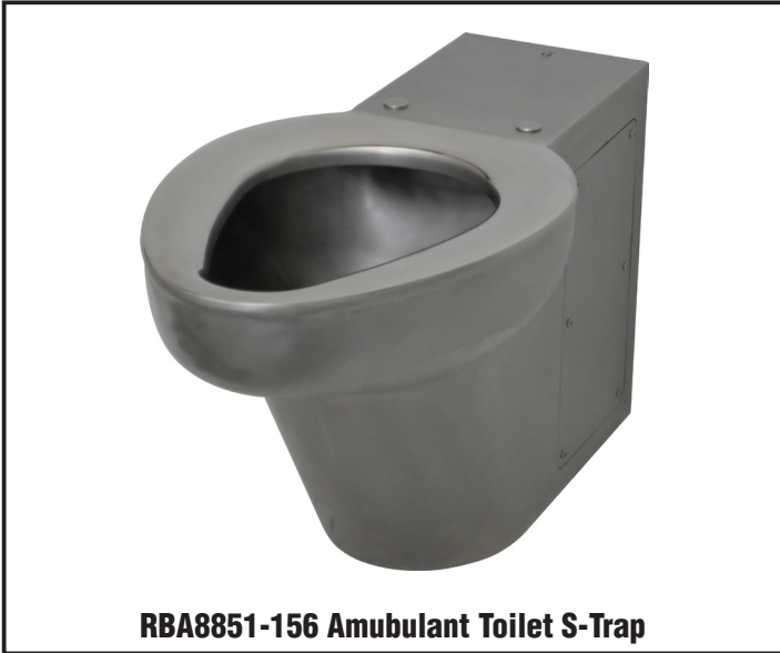
RBA8851-156 Amubulant Toilet S-Trap