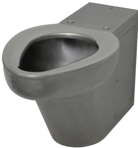
RBA8851-156 Amubulant Toilet S-Trap